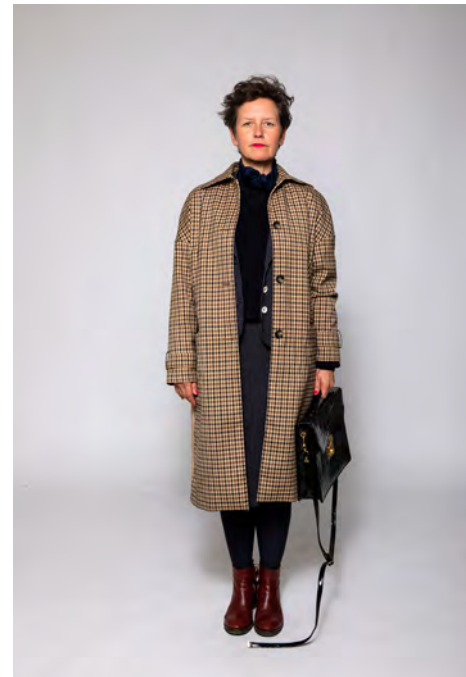
Die Bürgermeister*in (The Mayoress)

Curating COMMON PLACES - Participation and Theatre, we were following the motto 'show, don't tell'. Nevertheless, some introductory telling has to be done: The festival team welcomes you from a special set up in the studio. We introduce ourselves and get you in the mood for three days full of discussion and input. We are also pleased to hear a welcoming address by Petra Olschowski, State Secretary in the Ministry of Science, Research and the Arts Baden-Württemberg. Before we move to more interactive zoom sessions in the upcoming days, Thursday's program can be enjoyed conveniently as a stream. Make yourselves comfortable and tune in!