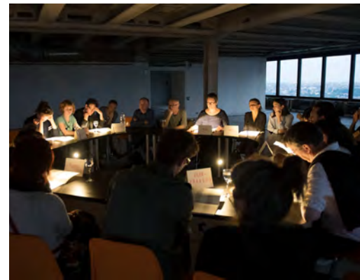
Your Word In My Mouth