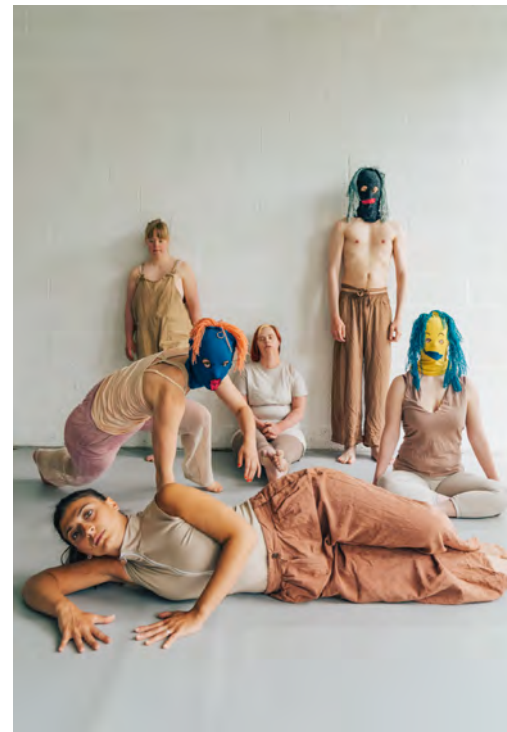
Shifting Faces

Many people would rather dance in dark clubs with loud music, artificial smoke and flickering lights than go out on a stage! The fear of being judged for one's awkward movements is too strong. Western societies are characterised by the difficult relationship to one's own body and to bodies in society, making participatory dance work in Central Europe particularly challenging, but also particularly empowering - if fixed ideas of 'skill' or 'talent' can be overcome in the process. At the same time, the physical approach can facilitate communication across language barriers. After having watched Shifting Faces , three representatives from companies in Germany, Austria and the Netherlands discuss how dance can become a form of expression for anyone and how standard ideas of technique and physique aren't the end-all, be-all for artistic quality.