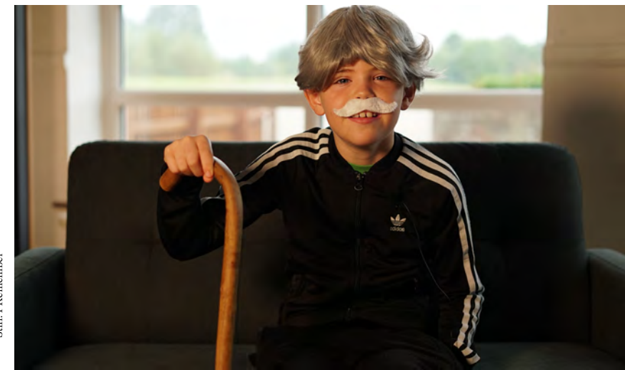
Still: I Remember