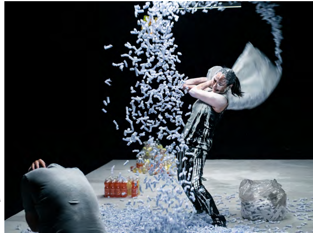
Stille Slag, Photo: Søren Meisner

A production of Østerbro Teater Copenhagen.